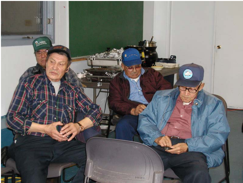
Public meeting in Dettah.