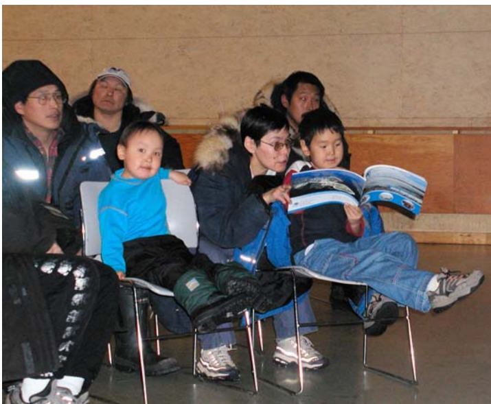
Public meeting in Kugluktuk.

PowerPoint presentation: Staff developed a PowerPoint presentation that outlined EMAB's accomplishments to date, and focused on explaining the areas where EMAB does most of its work. EMAB's mission statement was included. The presentation also noted that there were areas in the mandate that could use more attention, while recognizing that there are limited financial resources and decisions always have to be made as to where those resources should go. This presentation was reviewed by the Board.